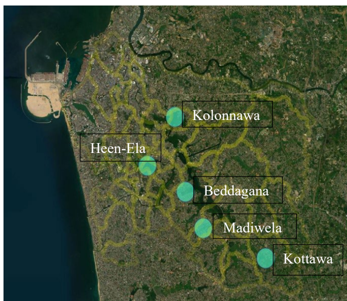
Figure 1: Wetland sites

In January and February 2022, members of the Cobra Collective visited Sri Lanka and offered training on participatory video-making to stakeholders (government, non-government, and communities including youth) and others who were interested. A series of physical meetings were held at IWMI, Diyasaru park and at the wetland sites of Beddagana, Kolonnawa, Kottawa, Heen-Ela and Madiwela. (Figure 1)